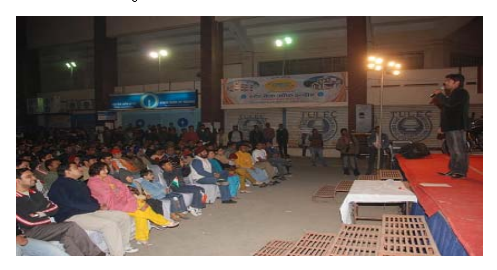
A Picture clip from "Utsaha"

The title sponsor for UtsAha! was Reliance Smart Telecom. Other organisations involved with UtsAha were Hero Honda, Marico, ITC, Reckitt Benckiser, Coca Cola, Reliance Fresh, ScratchMySoul.com and IMS Education among others.