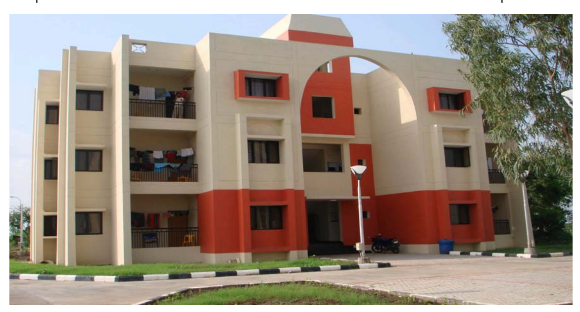
Type III & IV Quarters

Computer Lab on first floor and Administrative Office on first floor above PGP Office is completed.