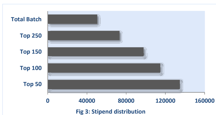
Fig 3: Stipend distribution