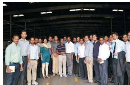
PGP-RAK participants during their visit to RAK Ceramics on April 22, 2013