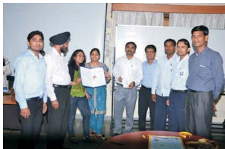
Glimpses of Game Competition and Birthday Celebration