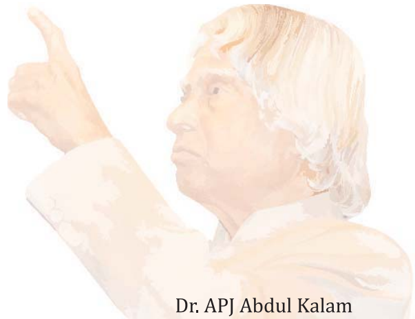
Dr. APJ Abdul Kalam

Former President Dr. APJ Abdul Kalam visited IIM Indore on June 12, 2013. Dr. Kalam's visit began with a group photograph with the students of Five Year Integrated Programme in Management (IPM) that was followed by a brief interaction with the children of IIM Indore community. Dr. Kalam in his opening remarks said that 'Before you do anything, stop and recall the face of the poorest, most helpless, destitute person you have seen and ask yourself, what I should do which may help him' . Speaking on the theme Create a Leadership: Essence of Good Governance , Dr. Kalam advised the students to be the captain of their problems, defeat the problems and succeed in life.