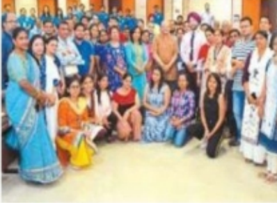
पत्रिका PLUS रिपोर्टर