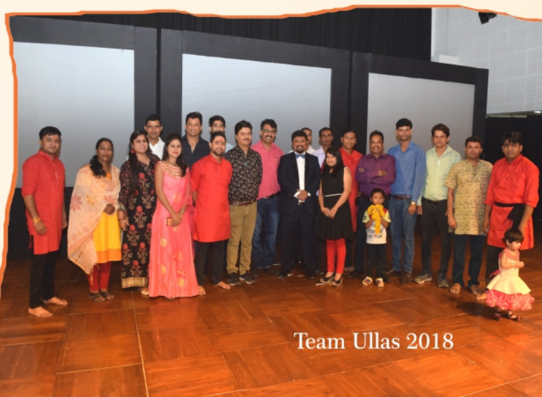
Team Ullas 2018

Nargundkar, R. (June 20, 2018). What If? [Blog Post]. Available at http://rnargundkar.blogspot.com/2018/06/what-if.html .