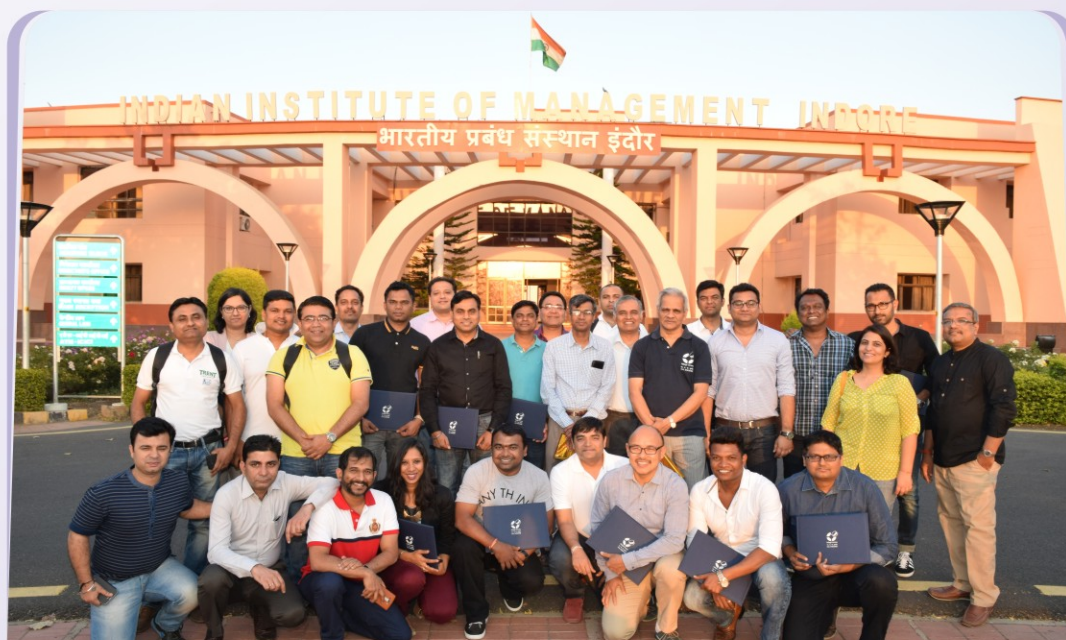
Participants of Trent Limited MDP with faculty members of IIM Indore