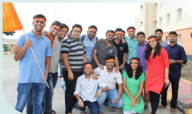
Ganesh Utsav celebration at IIM Indore