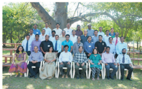
Participants of MDP on Interpersonal Effectiveness and Team Building