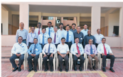
Participants of Canara Bank Executive Development Programme