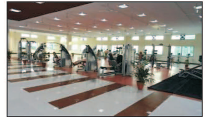
The New Gymnasium