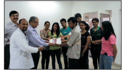
Doctors of MY Hospital and IIM Indore Participants during the Blood Donation Drive

A blood donation drive was organized by Pragati —the social sensitivity cell and AaRoHan —social & corporate responsibility cell of IIM Indore on October 6, 2013. The drive was successfully carried out by a team of 18 doctors/medical attendants from Model Blood Bank, MY Hospital, Indore. It witnessed a huge participation of 120 donors which included students and staff of IIM Indore.