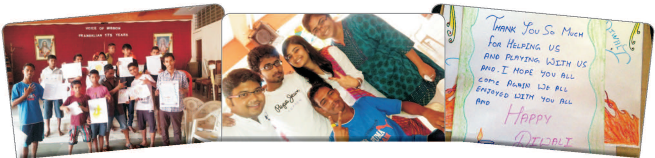
IIM Indore Volunteers of Ummid and Ashram children celebrating Diwali at the Mermier Bal Ashram, Mumbai