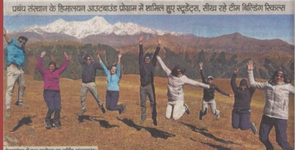
केदारकंठा में हुए स्टूडेंट्स का सर्किट आउटब्रोक।

श्रीलंका के हिमालय आउटब्रोक प्रोग्राम में शामिल हुए स्टूडेंट्स, सीख रहे टीम बिल्डिंग स्किल्स श्रीलंका के हिमालय आउटब्रोक प्रोग्राम में शामिल हुए स्टूडेंट्स, सीख रहे टीम बिल्डिंग स्किल्स। 40 से 60 के ग्रुप में ये स्टूडेंट्स ब्रह्मलान, दवाग, केदारकंठा और नैमिलन के चार आग्राम जैसी जगहों पर अलग-अलग फुटवॉल टूर्नामेंट में भाग ले रहे हैं। 190 से ज्यादा स्टूडेंट्स साइड 12 हजार फीट की ऊंचाई पर जगहों पर केदारकंठा पर हैं। इस प्रोग्राम में शामिल स्टूडेंट्स को टास्क परफॉर्मिंग के अगुआ 4 फीट स्टूडेंट्स शामिल