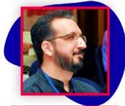
OUR GUEST SPEAKER

IIMIAA in association with Delhi NCR Chapter is hosting an in-person Meet-up with