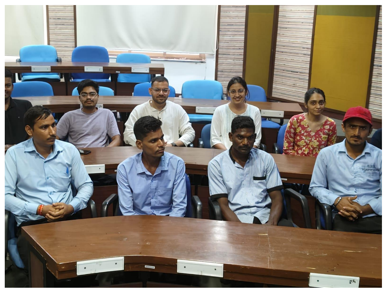
Official of IIM indore and the Local citizens attending RTI Awareness Programme