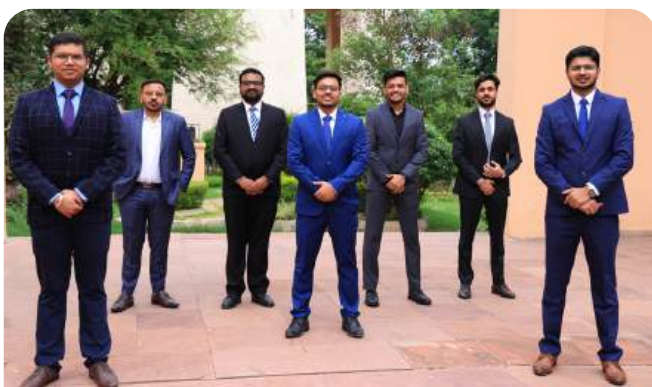
Corporate Interaction Committee