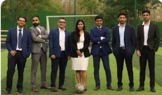
Sports and Cultural Committee