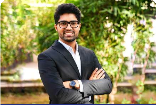
SAC Coordinator and Class Representative