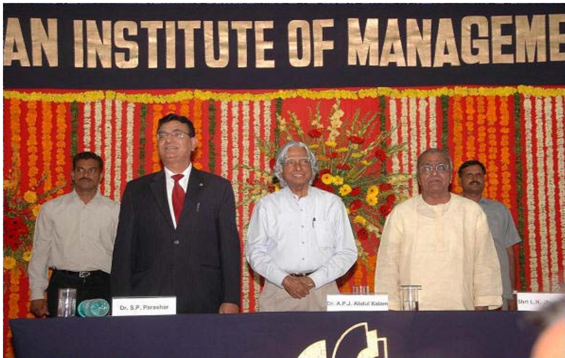
Picture 1: Dr. A.P.J. Abdul Kalam addressing the audience on the occasion of Eighth Foundation Day Lecture held on 3.10.2007 at the Institute