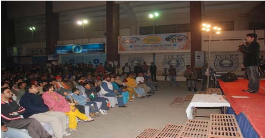
A Picture clip from "Utsaha"

The title sponsor for UtsAha! was Reliance Smart Telecom. Other organisations involved with UtsAha were Hero Honda, Marico, ITC, Reckitt Benckiser, Coca Cola, Reliance Fresh, ScratchMySoul.com and IMS Education among others.