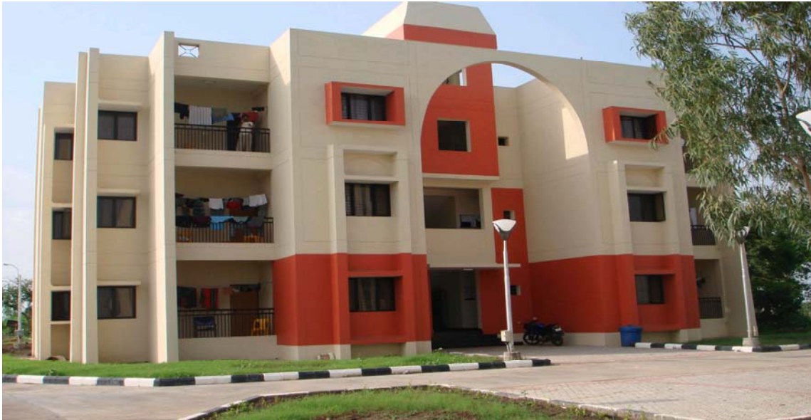
Type III & IV Quarters

Computer Lab on first floor and Administrative Office on first floor above PGP Office is completed.